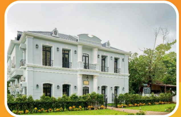
2nd Inning House